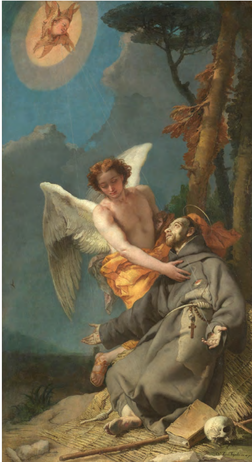
Giambattista Tiepolo, The Stigmatization of St. Francis , ca. 1767–69. Museo Nacional del Prado, Madrid.