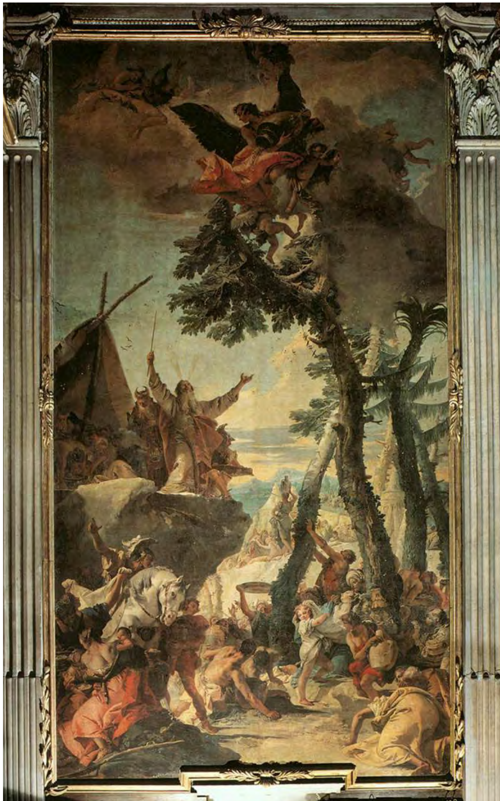
Giambattista Tiepolo, The Fall of Manna , ca. 1740–42. Basilica of San Lorenzo, Verolanuova.