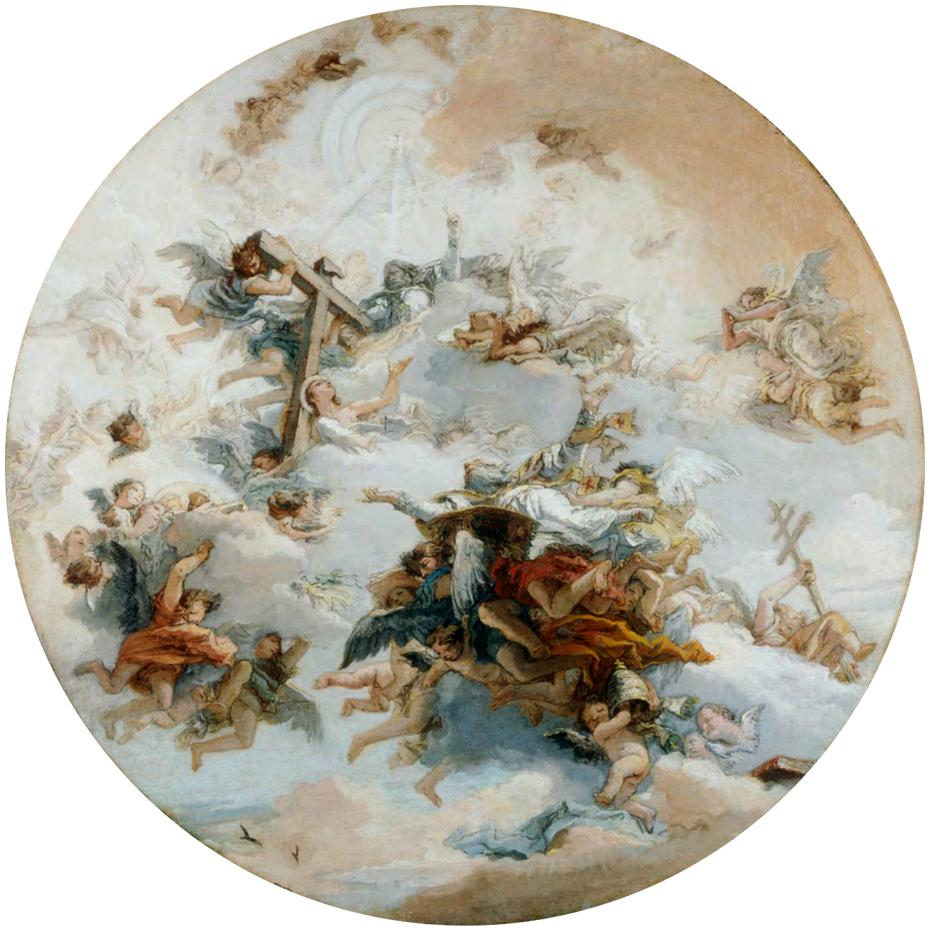
Domenico Tiepolo, St. Leo in Glory, ca. 1783. Victoria and Albert Museum, London; CAI.95.