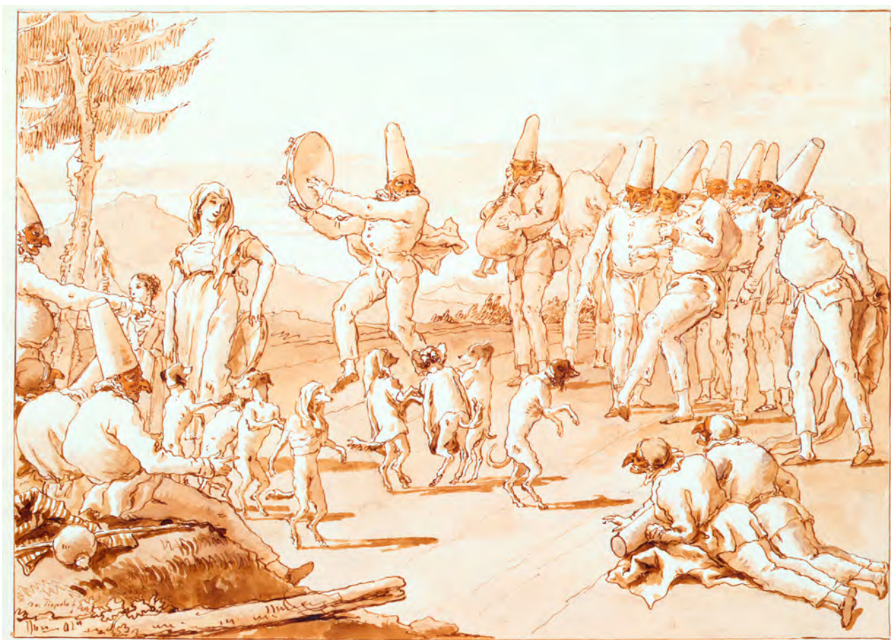
Domenico Tiepolo, Punchinellos with Dancing Dogs , ca. 1797–1804. Harvard Art Museums/Fogg Museum, bequest of Meta and Paul J. Sachs; 1965.421.