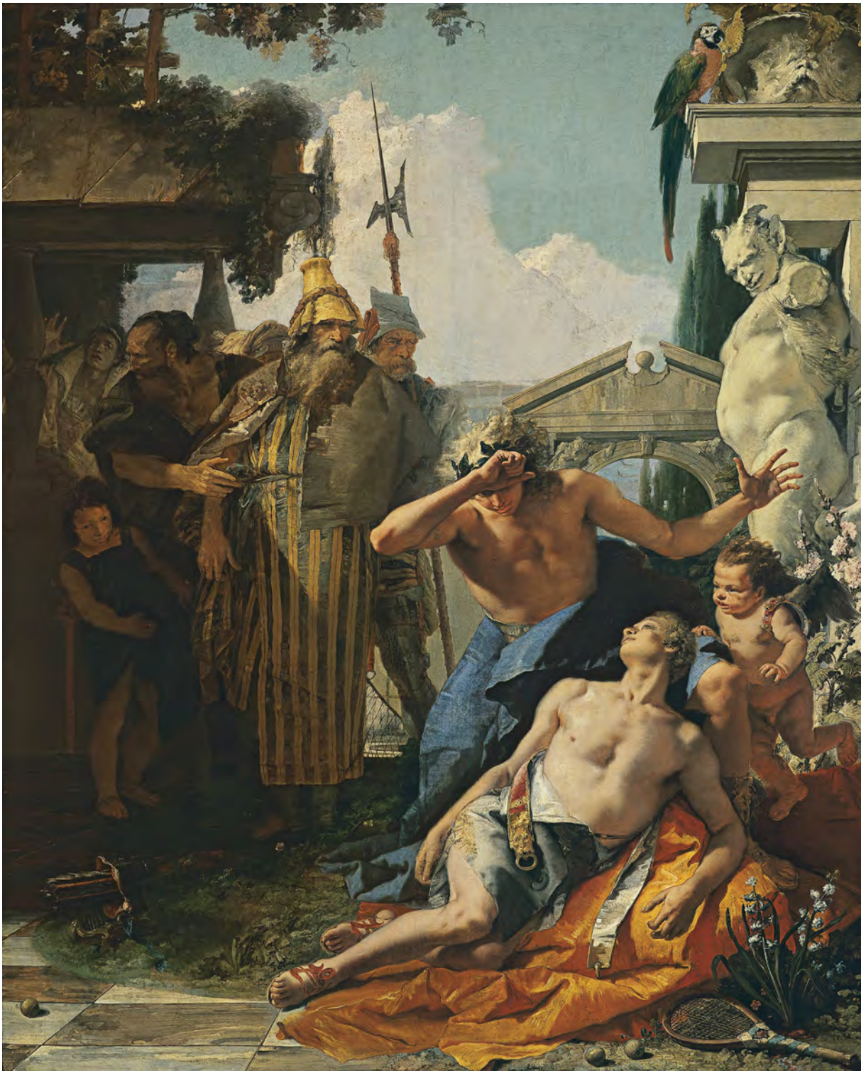
Giambattista Tiepolo, The Death of Hyacinth , ca. 1752–53. Museo Nacional Thyssen-Bornemisza, Madrid; inv. no. 394.