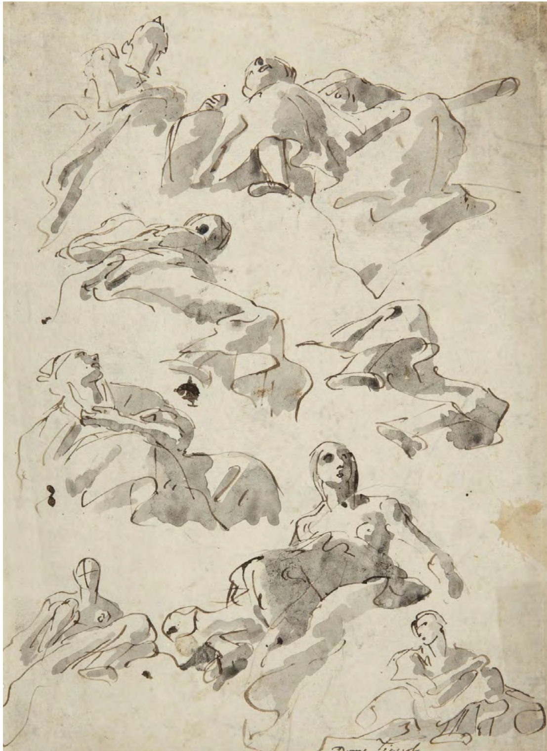
Domenico Tiepolo, Studies of Figures Seen from Below , ca. 1745–50. Princeton University Art Museum, bequest of Dan Fellows Platt; x1948-896.