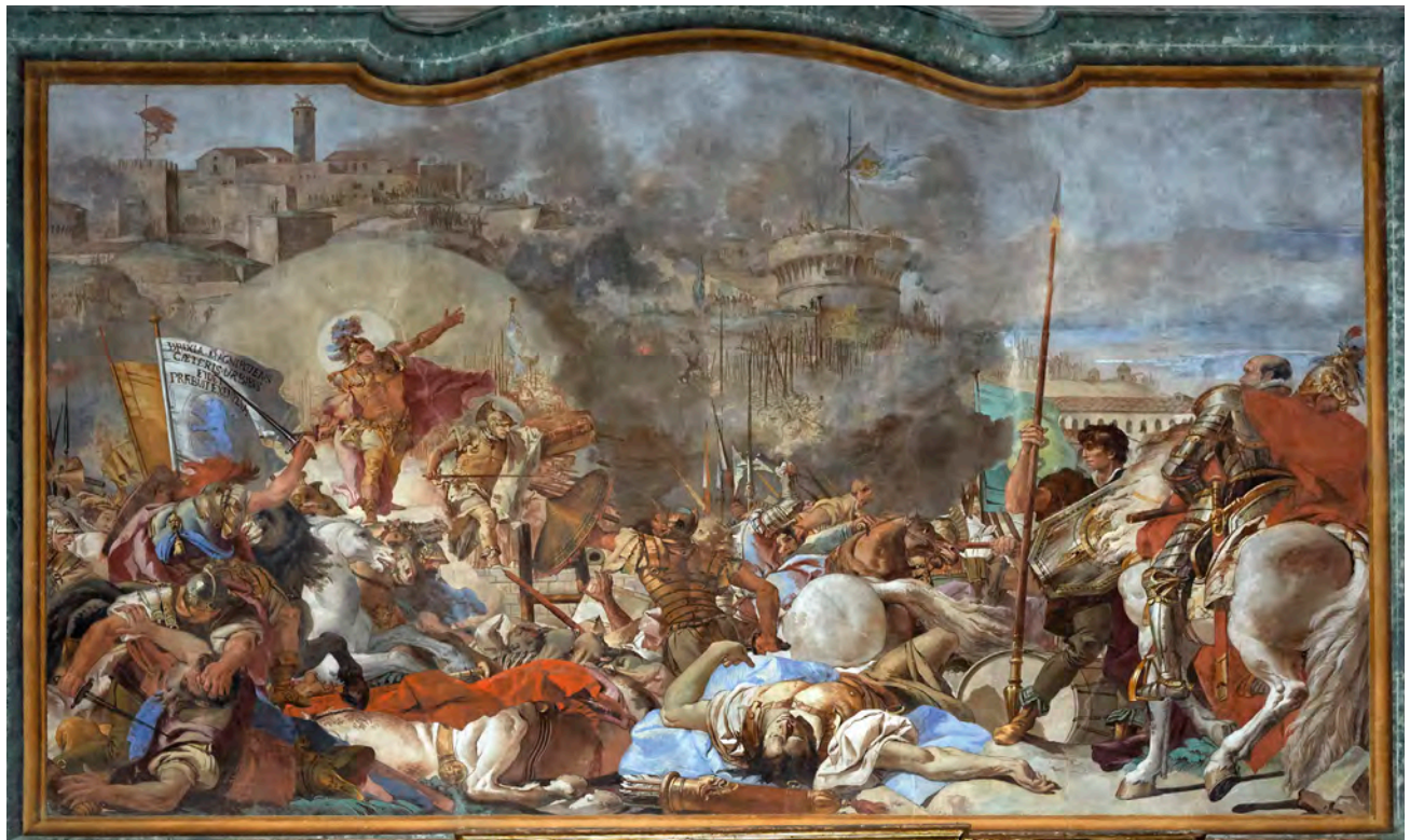
Domenico Tiepolo, The Miraculous Apparition of Sts. Faustinus and Giovita in the Defense of Brescia in 1438 , ca. 1754–55.

Santi Faustino e Giovita, Brescia.