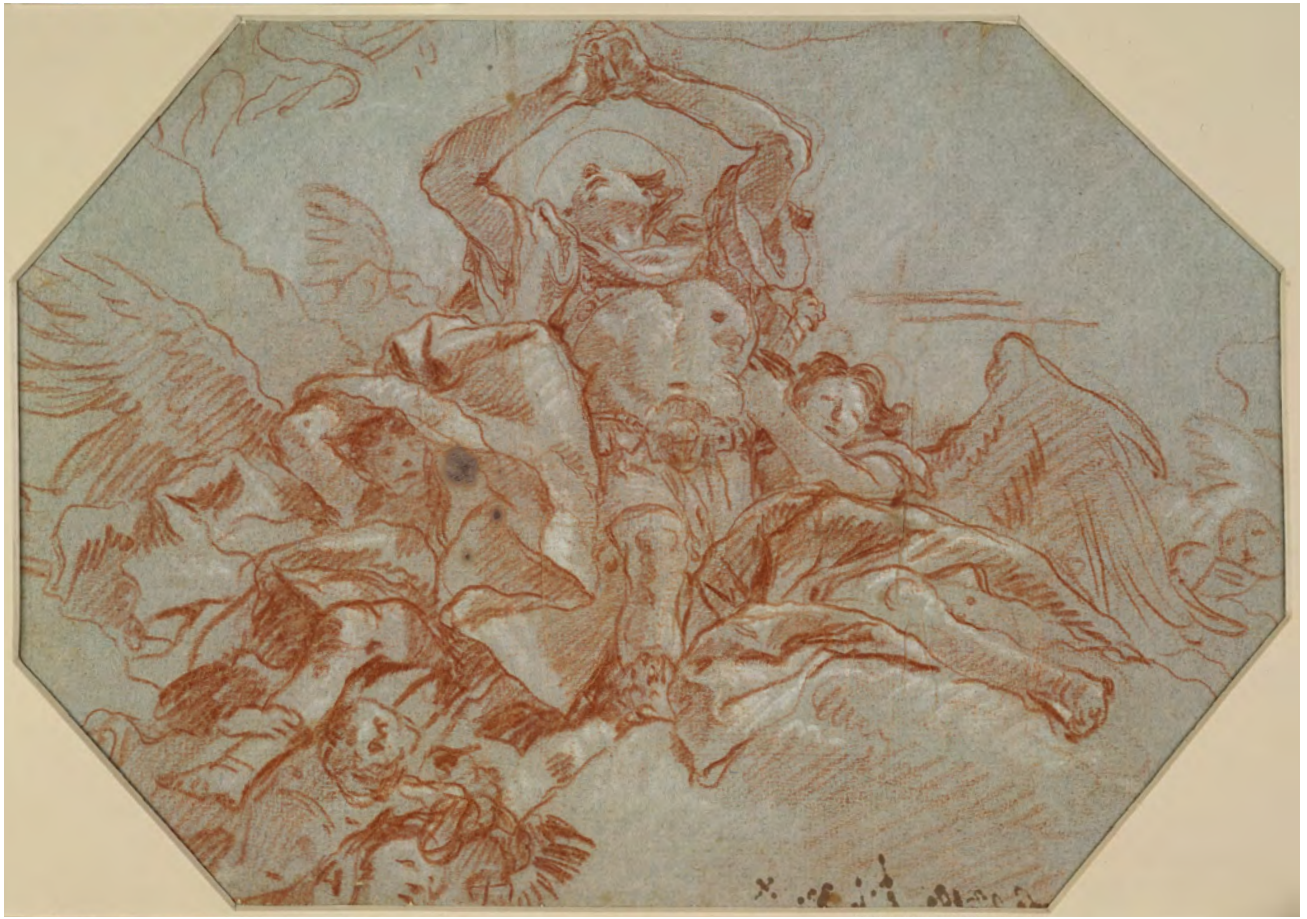
Domenico Tiepolo, St. Jovita Carried to Heaven , ca. 1754–55. British Museum, London; 1930,0414.36.