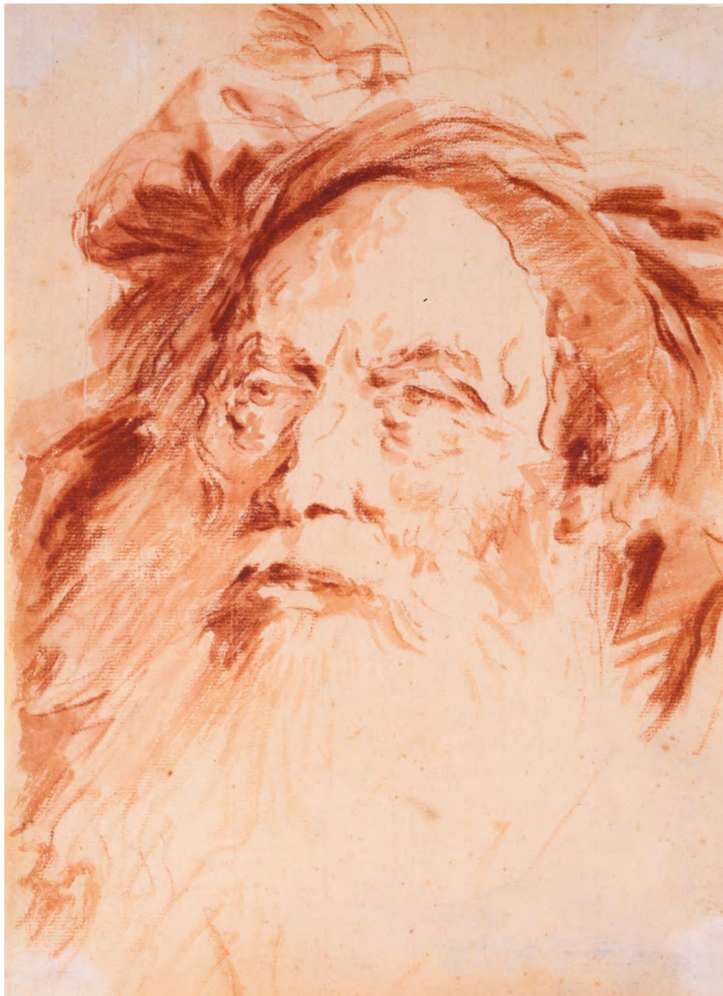
Giambattista Tiepolo, Head of a Bearded Man , ca. 1735–40. Harvard Art Museums/Fogg Museum, Francis H. Burr Memorial Fund; 1946.52.